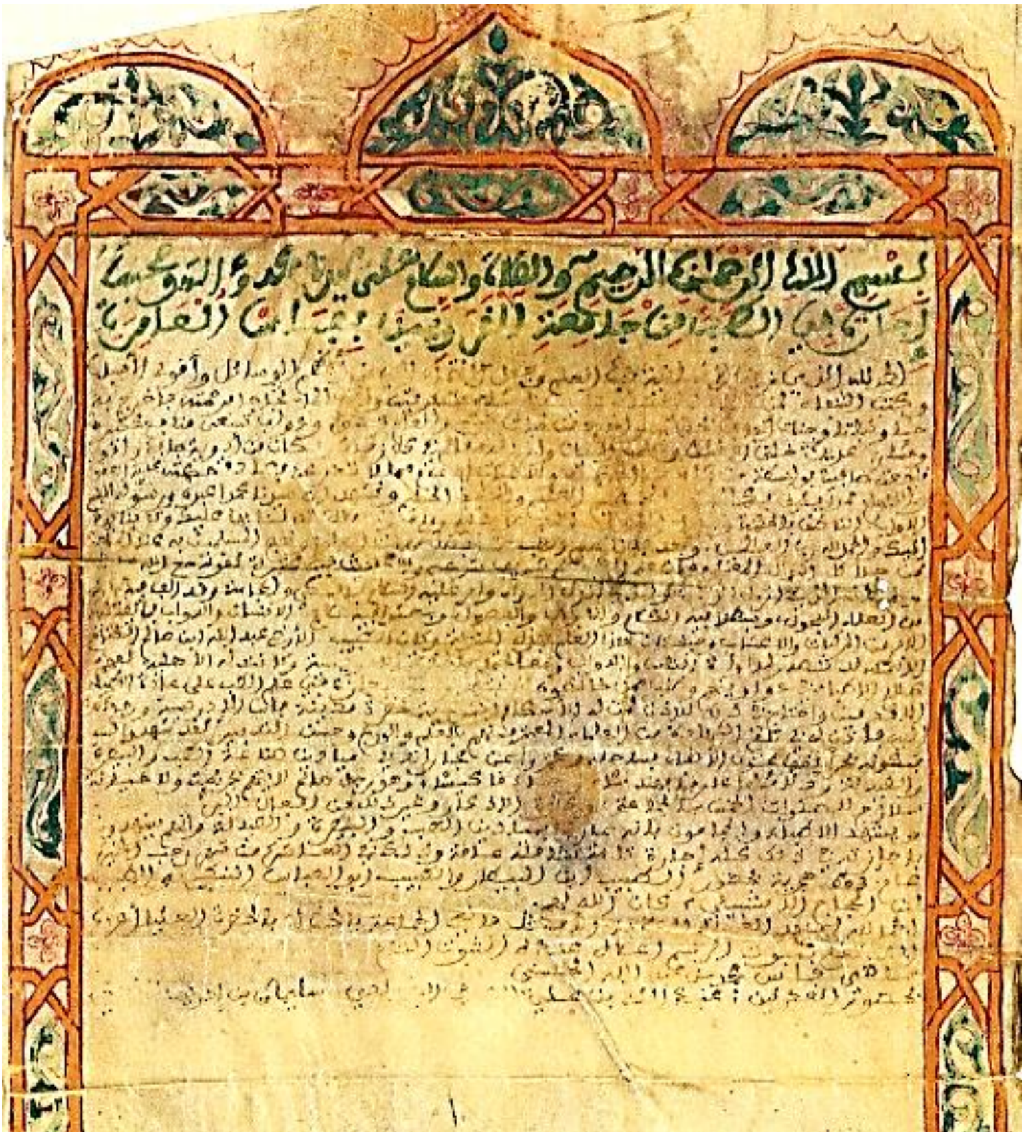
Figure 1: "IJAZAH" delivered in Medicine from AL Quaraouiyyine University in Fez- Morocco in 1207 A.J.C (603 of Islamic Calendar)