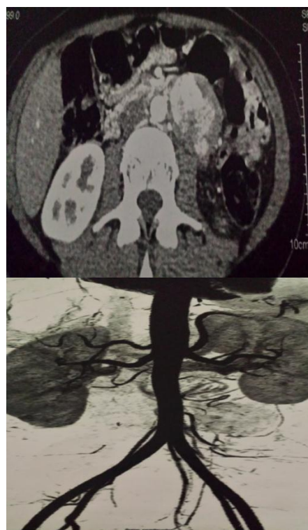
Fig 1: CT image of the paraganglioma of the organ of Zuckerkandl.

The abdominal angio-CT scan performed, showed a polylobate retroperitoneal mass situated on latero-aortic surface and under the left kidney in close contact with the psoas muscle. The mass measured 7.2 cm on its longest axis and 5 cm in thickness with a tissue-like nature inferiorly, hypodense superiorly and contrast enhancing externally. There was a mass effect on the branches of the superior mesenteric vein externally without any signs of invasion or lymphadenopathies. (FIG. 1)