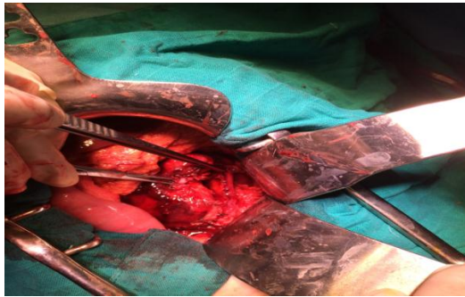
Figure 2: Vascular proximity of the paraganglioma

The histopathological examination of the tumor and of what was believed to be an accompanying adenopathy showed that the two samples had the same histological appearance and that no lymph node tissues were found. Detailed analysis showed tumor proliferation made of nested strands supported spans by spindle-shaped cells producing a Zellballen aspect within a richly vascularized stroma. Tumor cells had pleomorphic nuclei and a finely granular eosinophilic cytoplasm. Mitosis was rare and the proliferation contained focal hemorrhagic suffusions and fibrous remodeling. The mass was well limited by a thick fibrous capsule and there was no vascular embolus.